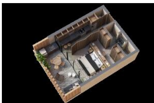
LUZ 1 (U-301b) 3.480.2 m 2