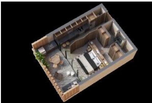
LUZ 1 (U-301b)